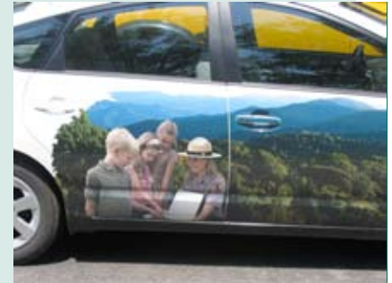
"Cleaner Car / Cleaner Air" fuel efficient vehicle. Spotted near the Visitor's Center in the Great Smoky Mt. National Park.

Have you found a great website? If your site is education or professional development related send the address to webmaster@nawta.org . We will share your findings on our Resources page.