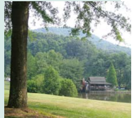
Haywood Community College Campus at Clyde, North Carolina.