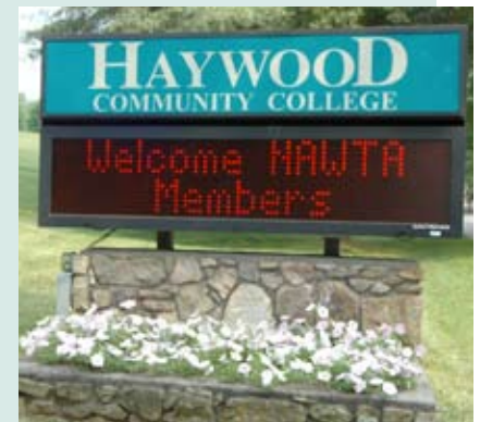
A Warm Welcome!