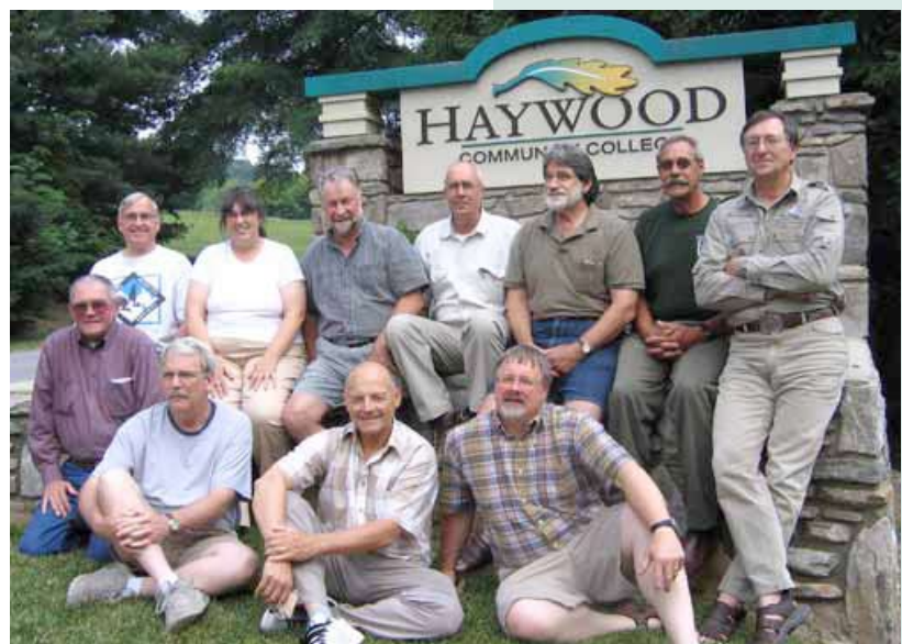
Member representatives for the 2006 NAWTA meeting: