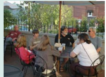
Dining out in Clyde, NC